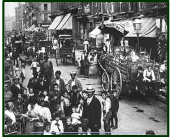
A Scene from New York City in those days.