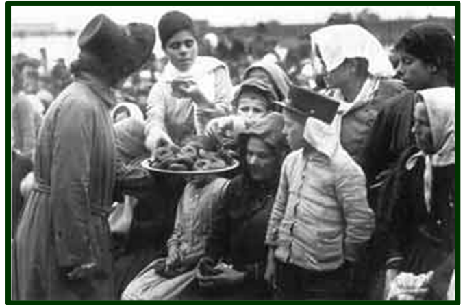
Many religious groups cared for both the practical and spiritual needs of the new immigrants.

Simpson’s experience of divine healing was greeted with skepticism and suspicion by many. Some flatly rejected his “questionable teaching.” Simpson further ruffled religious feathers when he was baptized by immersion. In addition, Simpson was feeling increasingly frustrated by his inability to open the hearts of his congregation to the recent immigrants that were coming to salvation on the streets of New York City. Eventually Simpson was led to leave his pastoral position with its security and prestige.